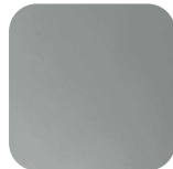
Classic Colour Finish Telegrey