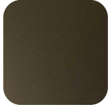
Metallic Finish Dark Metallic Bronze Coating