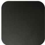
Classic Colour Finish Black Grey