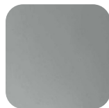
Classic Colour Finish Telegrey